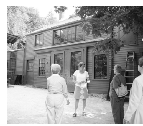
Fairsted staff and Friends' Board members tour barn prior to construction start.

Construction is scheduled to begin August 2007 and last 18 months. It will be another several months after that, however, before park staff is able to move both themselves and all the museum pieces that have moved offsite during construction back to their original, familiar homes.