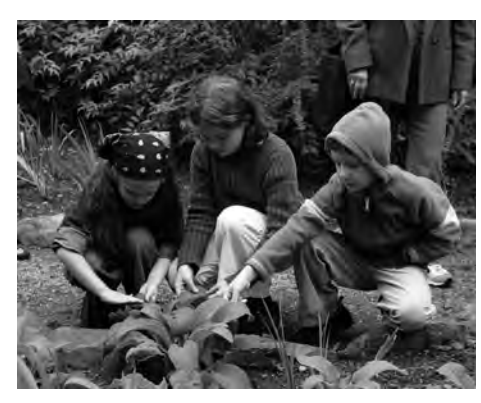
Students from the O'Hearn School in Dorchester explore the Fairsted landscape.

During its pilot phase, the program will be tested in selected Boston and Brookline schools. When fully implemented, it will reach 600 third graders each year. The program also has the potential to become a model for similar inter-disciplinary programming in communities around the nation.