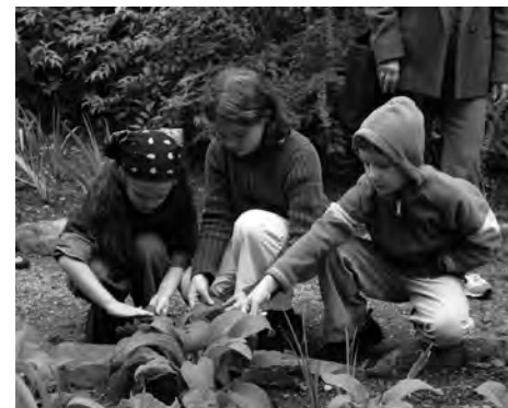
Students from the O’Hearn School in Dorchester explore the Fairsted landscape.

During its pilot phase, the program will be tested in selected Boston and Brookline schools. When fully implemented, it will reach 600 third graders each year. The program also has the potential to become a model for similar inter-disciplinary programming in communities around the nation.