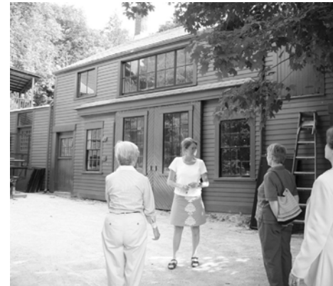
Fairsted staff and Friends' Board members tour barn prior to construction start.

Construction is scheduled to begin August 2007 and last 18 months. It will be another several months after that, however, before park staff is able to move both themselves and all the museum pieces that have moved offsite during construction back to their original, familiar homes.