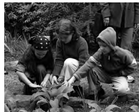
Students from the O’Hearn School in Dorchester explore the Fairsted landscape.

During its pilot phase, the program will be tested in selected Boston and Brookline schools. When fully implemented, it will reach 600 third graders each year. The program also has the potential to become a model for similar inter-disciplinary programming in communities around the nation.