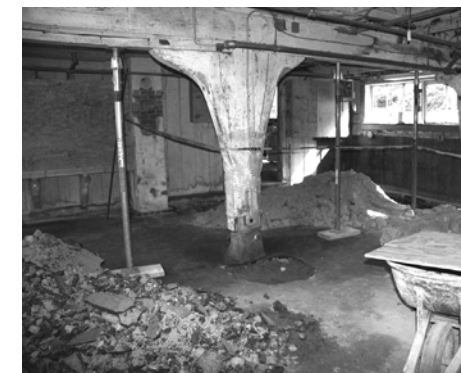
The barn at Fairsted will become a focal point for Good Neighbors activity.