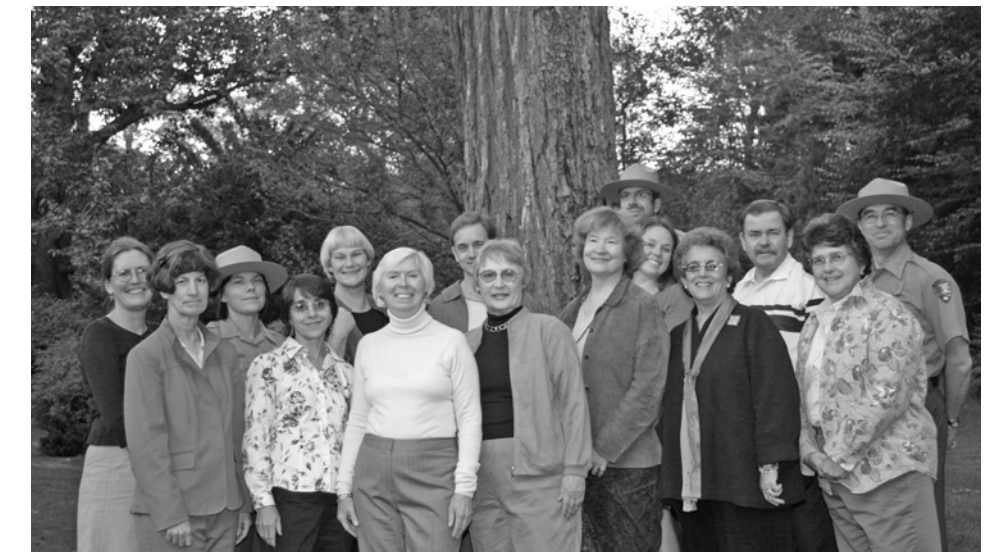
Friends of Fairsted board and U.S. Park Service staff gather under the elm on the south lawn.