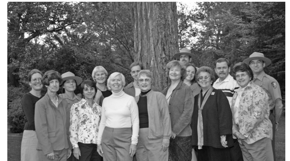
Friends of Fairsted board and U.S. Park Service staff gather under the elm on the south lawn.